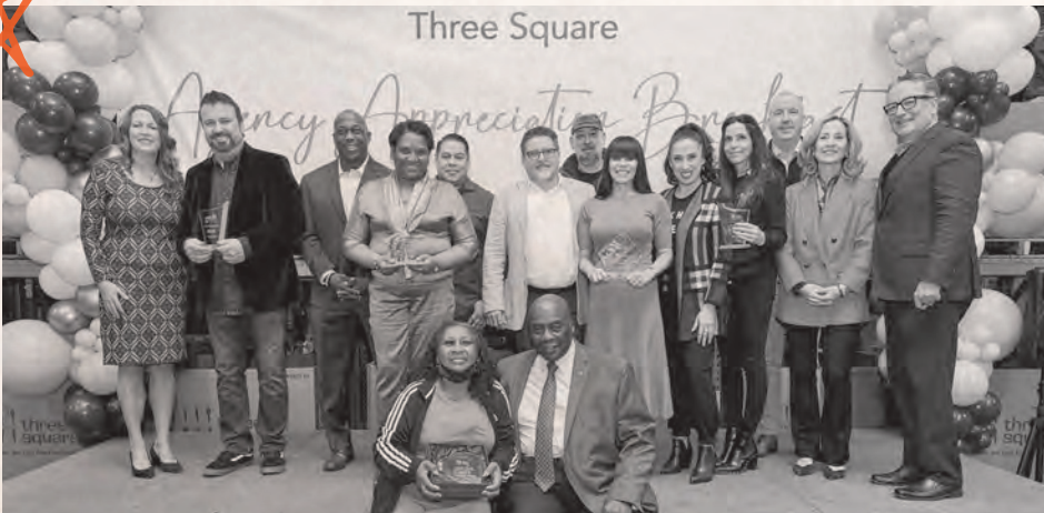
Three Square staff and board members celebrate our Agency Partner award recipients.